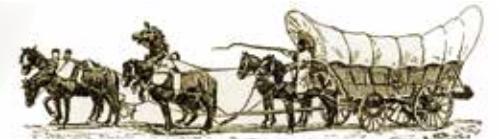
National Road Freight Wagon